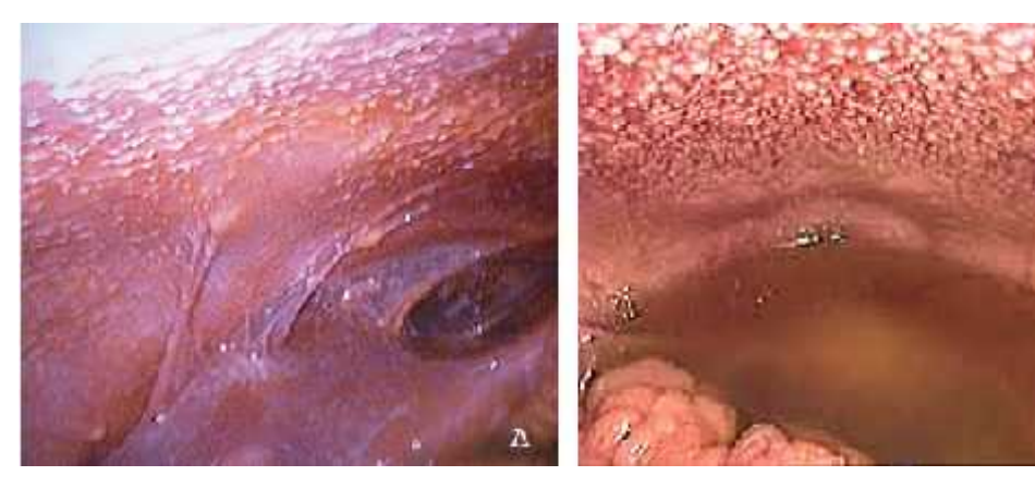
Figure 1 Laparoscopic exploration shows the presence of multiple whitish granulations in the peritoneum, omentum and in the hepatic area (A). The uterus and appendages are embedded in a serohematic peritoneal effusion (B).

Determining CA125 levels does not really help diagnose pelvic tuberculosis, as it is a rising marker in more than 80% of ovarian cancers but also during certain chronic inflammatory conditions (Panoskaltsis et al , 2000).